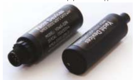
With SeaTalk NG or N2K Connectors