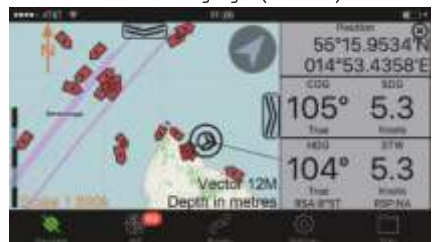
AIS data on SEAIQ Open iPhone app